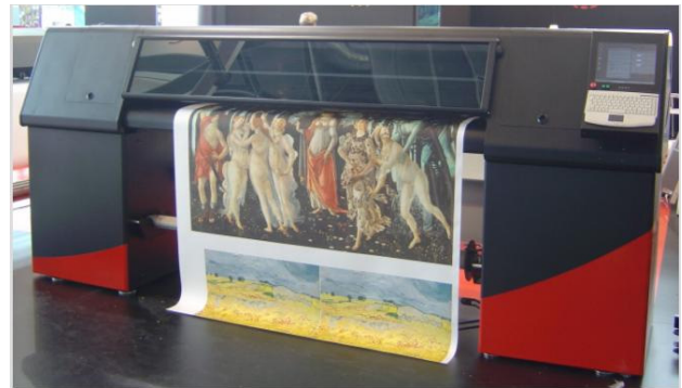
Figure 2. Neolt UV plotter powered by Ardeje

In that way, a machine, represented on figure 2, is finalized to be able to print on flexible or rigid substrates up to 50 mm, using UV curing inks. Eight printheads may be embedded to obtain the best results, in CYMK colors. The best productivity is up to 25sqm/h and maximum resolution is up to 400 x 400 dpi. This UV plotter is designed in three print widths, 180, 250 and 320 cm.