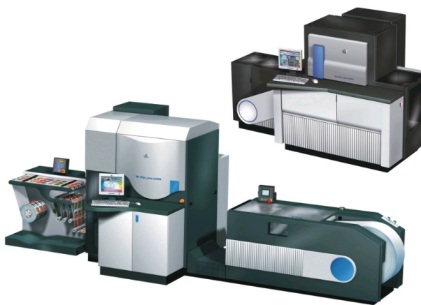
Figure 3. HP Indigo ws4050 (bottom), HP Indigo ws2000 (top)