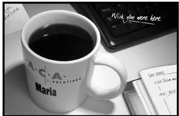
Figure 3. Detail of postcard image containing personalized desktop and coffee cup. (PictureTalk® image)

The response rate for this second mailing was 12%. Even more important, it reached people with a much better profile. From a cost perspective, the second mailing was 'only' 20% more expensive than the conventional one.