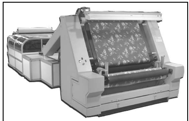
Figure 5. Reggiani Macchine S.p.A. Dryer

A transporting belt moves the fabric through a group of regulated electrical hot air dryers. This process allows for the printed fabric to be dried and finally rolled for steaming and washing.