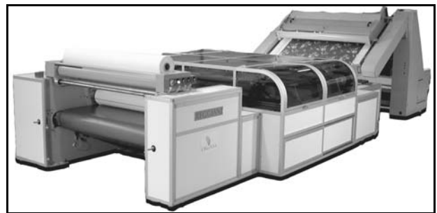
Figure 2. Reggiani Macchine S.p.A. DReAM printing machine (Prototype 1)

To reach this objective Reggiani Macchine S.p.A. searched for world class partners to collaborate in this project, deciding on Scitex Vision as a partner to supply the Aprion digital print heads and Ciba SC to supply inks and research. This partnership has been operational since December 2000 and has after 2 two years delivered a highly innovative textile printing machine.