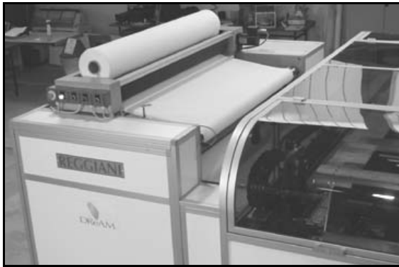
Figure 3. Reggiani Macchine S.p.A. Fabric feed

through a system which filters through a microfilter and degausses to guarantee the efficiency of the ink systems and the nozzles.