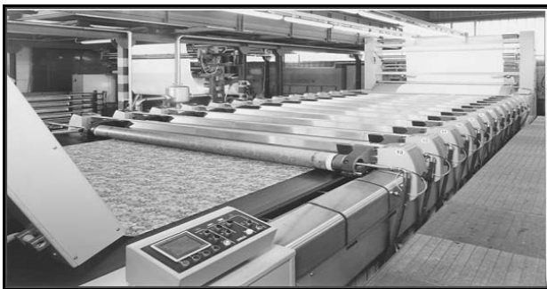
Figure 1. Reggiani Macchine S.p.A. rotary screen printing machine

Reggiani Macchine S.p.A. values strength in innovation and a high quality product, industry standards are benchmarked by our initiatives and our after sales support is unequalled. We have successfully installed 1000 rotary printers and 400 flat screen printers.