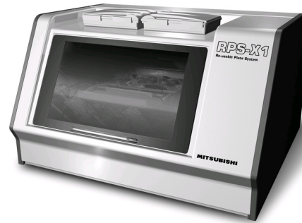
Figure 2. RPS-X1

proven that recycling is possible up to 20 times by preventing accumulation of residues in erasing as much as possible. For the above reasons, an epoch-making system configuration which deals with a small lot of up to 25,000 in average to allow reduction in printing material cost and efficient workflow has been realized while maintaining the same level of productivity as that of the conventional offset press.